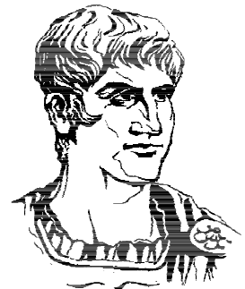
Nero (Emperor A.D. 54-68)

come from Italy (Acts 18:2). Luke does not record their conversion to Christ. This may indicate that they were already Christians before leaving Italy. Upon the writing of the epistle to the Romans, Aquila and Priscilla had returned to Rome (Rom. 16:3). This could have occurred after Nero came to power in A.D. 54. A congregation in Rome met in their house (Rom. 16:5).