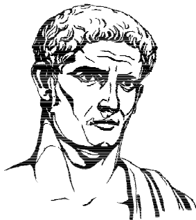
Claudius Caesar (Emperor A.D. 41-54)

The history of the church in Rome may go back to the beginning of the gospel, when the Lord's church was first established on the day of Pentecost. Luke tells us, through the Holy Spirit, that on the first Pentecost after Jesus' death, burial and resurrec-