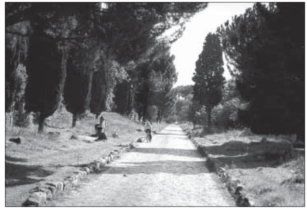
Via Appia, the road by which Paul entered Rome (Acts 28:15).

destructiveness of sin and then two chapters to the explanation of God’s solution to this problem (4:1-6:23). Second, in the heart of the book, he addresses the problem of the Law (7:1-8:39) . To these Christians who had come to Christ out of Judaism, he demonstrates that while the Law of Moses did not offer a lasting solution to the problem of sin, the Law of Christ does. Third, the problem of Israel’s rejection of Jesus (9:1-11:36) . In the last half of the book the Apostle devotes three chapters to help these Jewish Christians understand why their own nation had re-